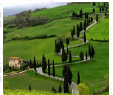
OOTY TEA GARDEN